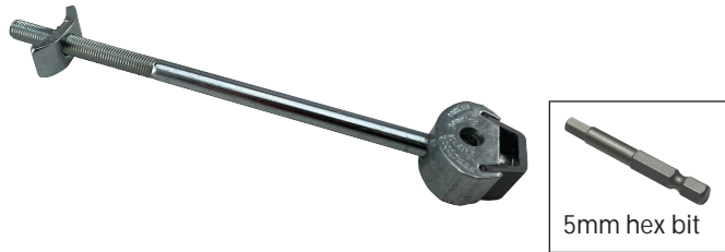
5mm hex bit